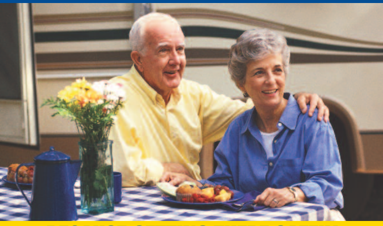
BECAUSE GETTING THERE SAFELY